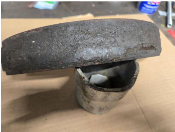
Brake shoes turned into mush from leaky wheel cylinders

New England has everything! From historic fishing villages, covered bridges and Bunker Hill to the most modern golf courses, air-conditioned summer theatres and the finest swimming in the world... whatever you want, New England's got it! There's a very special thrill in store when you journey to New England. For here are the quaint and quiet towns where the spirit of America was born. And for a perfect blend of the old and the new, there's nothing like a New England journey in the new kind of Ford. You ride in the heaviest, longest, loveliest car the money can buy. And no matter how long or winding your New England journey, you arrive refreshed, for you have an all-new inner Ford. Power? Ford's new Silver Anniversary V-8 power was made for those new New England superhighways. If you haven't yet discovered how new this new kind of Ford really is, see your neighborhood Ford Dealer and ask for an Action Test. Send for a free booklet and map! Write to: New England Journeys, Dept. N Back Bay P. O. Box 151, Boston, Mass. Name: _____ Street Address: _____ City: _____ State: _____ Ford Dealers of New England