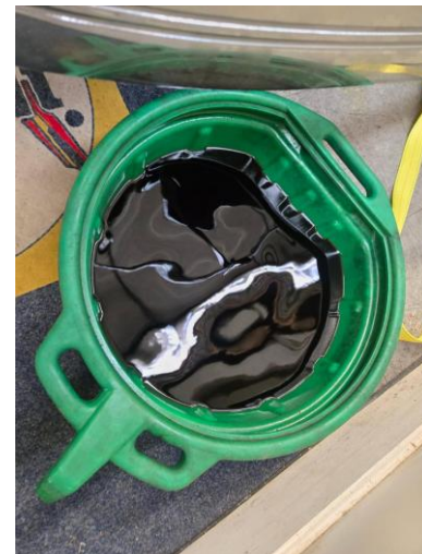
6-year-old gasoline as drained out

Now that you’ve got that new “ride” in your garage, here is what I would suggest next: