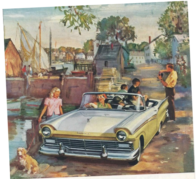
Figure on doing all this when you make your offer for your next classic car purchase and you will be money ahead.

New England has everything! From historic fishing villages, covered bridges and Bunker Hill to the most modern golf courses, air-conditioned summer theatres and the finest swimming in the world... whatever you want, New England's got it! There's a very special thrill in store when you journey to New England. For here are the quaint and quiet towns where the spirit of America was born. And for a perfect blend of the old and the new, there's nothing like a New England journey in the new kind of Ford. You ride in the heaviest, longest, loveliest car the money can buy. And no matter how long or winding your New England journey, you arrive refreshed, for you have an all-new inner Ford. Power? Ford's new Silver Anniversary V-8 power was made for those new New England superhighways. If you haven't yet discovered how new this new kind of Ford really is, see your neighborhood Ford Dealer and ask for an Action Test. Send for a free booklet and map! Write to: New England Journeys, Dept. N Back Bay P. O. Box 151, Boston, Mass. Name: _____ Street Address: _____ City: _____ State: _____ Ford Dealers of New England