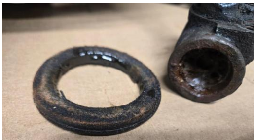
Hub seals and wheel cylinders which had not seen the road in 7 years look like tar