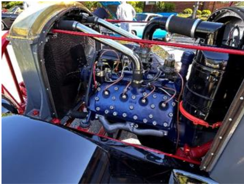
Same truck with Flathead V8 engine