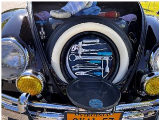
1957 VW Beetle with toolbox

A 1957 VW Beetle won Best Import. The owner had a complete book detailing the history of its use in movies and its detailed restoration. The car had an original toolbox stored in the middle of the spare tire.