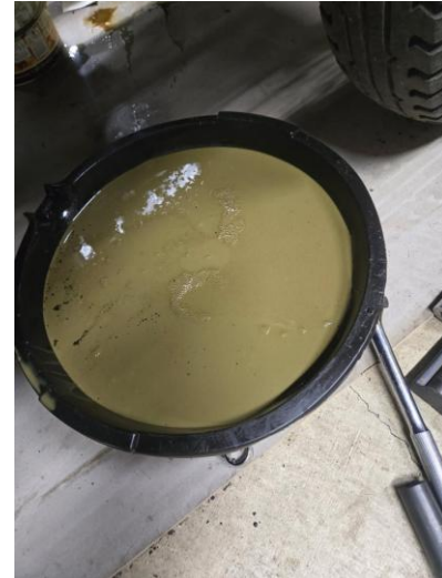
Crankcase oil from engine with blown leaking head gasket -looked like pea soup

Never pay “retail” for a car coming out of long-time storage. Fellow club member Jim Walker and I both recently bought “extended storage” cars and are now “into” the cars for an additional $3000.00 and counting—in tires, hoses, water pumps, brakes, ignition components and more—and we are doing the majority of the work. However, both of us based our offers accordingly, as we both knew what we were getting into. Don’t let our experiences stop you from purchasing your next “ride”. Getting a solid older restoration or original car back on the road is far easier than restoring a project.