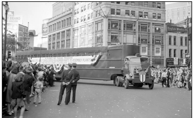
A specially designed and built dual engine Ford COE was used to haul Ford-built B-24 bomber subassemblies built at Willow Run to assembly plants in Texas and Oklahoma.