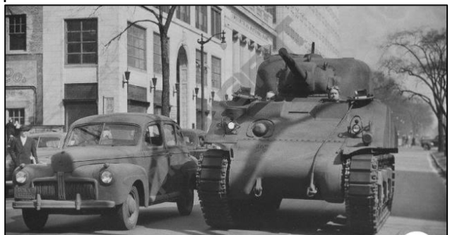
A '42 Staff Car in a post-war Memorial Day parade.