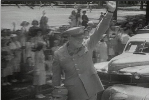
General Eisenhower and a '42 Mercury Woodie.