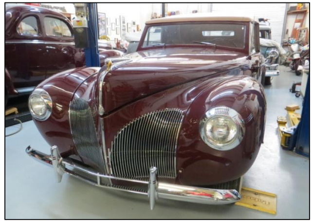
A better view of Al's '40 Continental Cabriolet.