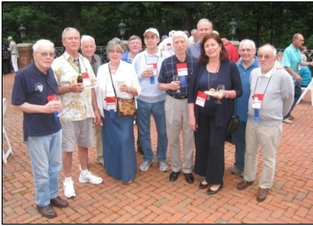
We kicked this off with a Welcome Party on the Terrace.