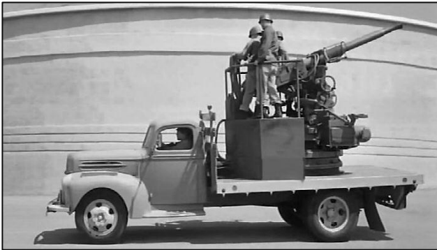
A mobile Anti Aircraft Gun?