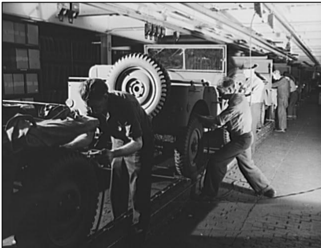
Jeeps being assembled at the Rouge.