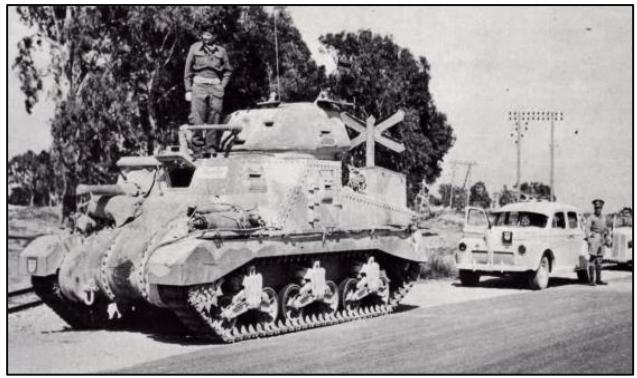
Not sure what the armored vehicle is but that's a '42 Staff Car.