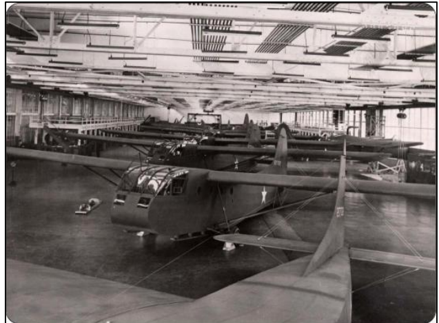
Ford-built CG-4A gliders in the Iron Mountain plant. Hey, it was basically built of wood and fabric so it must be Woodie, right?