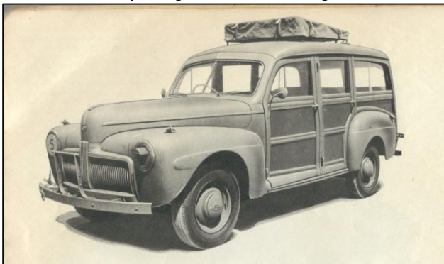
'42 Ford Station Wagon built for the Canadians