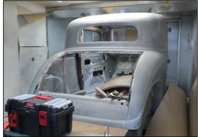
A "Father & Son...Just Having Fun" project.

It was a great to spend an afternoon with a long time car guy.