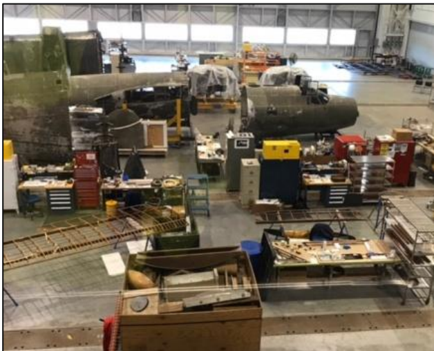
The fuselage of Flak Bait , a WWII B-26 Marauder bomber is under restoration in this view of the restoration facility. Flak Bait survived 207 operational missions over Europe, more than any other American aircraft during World War II.

On a final note: Fearing a breakdown with my '39 Woodie on the way to the museum with 40 classic Fords following me on a major highway, I decided to drive my new modern car to lead the pack so there would be no problems. The trip went well and the tour was fantastic but when I went to start my "new" car it had a dead battery. One by one the V8s started and drove away, all of them! Think about it, how ironic! I got a jump start and went to the dealer for a new battery under warranty and got back just in time for the Judges meeting. I should have bought a Ford.