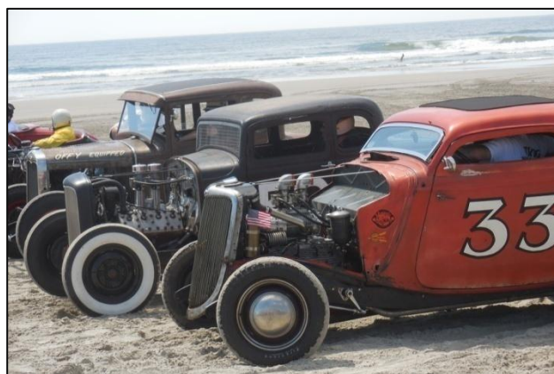
Not much of a view to either side from the '34 3 window.