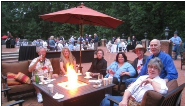
The fire pit felt wonderful on an unseasonably cool June evening.

June 7, 2017 – We finished up a very successful day one of the 2017 Eastern National Meet of the eV-8 club with a grand welcome party. Old friends/new friends/lovers of eV-8's gather at the Westfield's in Chantilly, VA for a fun social ... Did I mention good food and live music and singing??