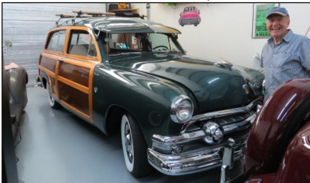
Everyone loves Woody's.