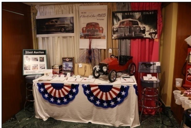
Guess who won the V-8 Raffle Car?

Our NVRG-hosted Raffle Room was placed in the “wedding planning room” of the Westfields Marriott in Chantilly, VA. The transformation from wedding products into a 75 th anniversary celebration of 1942 Ford, Mercury, and Lincoln products was something we hoped would bring smiles to lots of faces—and it succeeded!