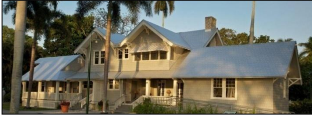
Henry Ford's winter house in Fort Myers is adjacent to...

Henry Ford spent several weeks a year at his winter home in Fort Myers. His home along with one that Thomas Edison owned are now both museums and the city of Fort Myers has long been proud of the city's connection to these men.