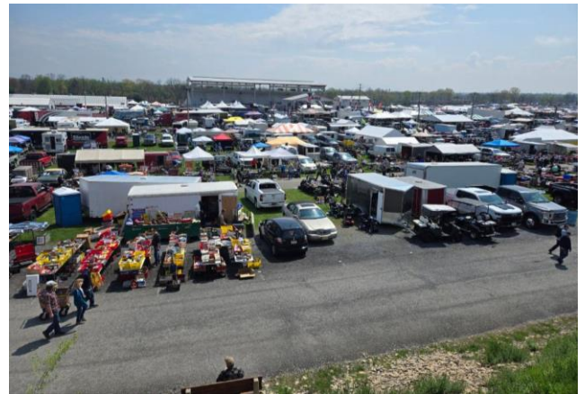
Carlisle view from hill by I-81