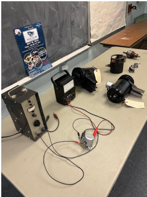
Blancard had several system parts available during his presentation