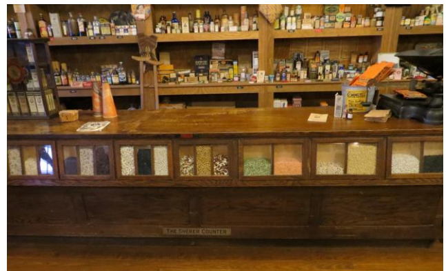
Merchandise in Tupper Store

After another fantastic Cajun Lunch, we stopped in at the Gator Chateau where you could hold a live baby alligator.