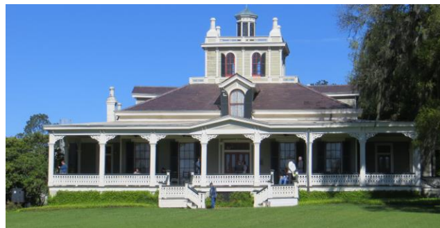
Joseph Jefferson Home, Iberia, LA

He built a grand home in 1870 and surrounded the property with magnificent gardens which are known today as “Rip Van Winkle Gardens”.