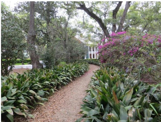
Grounds at The Shadows

Following lunch, we traveled to St. Martinville, the third oldest city in Louisiana. This is where the first Acadians (Cajuns) arrived in 1765. It is also where the Evangeline Oak made famous in Henry Wadsworth Longfellow's poem still stands. We also visited and toured the historic St. Martin de Tours Catholic Church, which is considered the Mother Church of the Acadians.