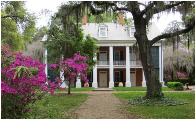
The Shadows Mansion

The docent presented a vivid picture of the lives of the people who lived, worked, and visited here from its plantation beginnings through the earliest days of the Civil Rights movement. Towering Live Oak trees surround this Classical Revival home and there are vibrant gardens as well.