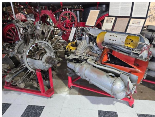
From Model T to the Jet Age