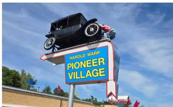
Entrance to the Pioneer Village