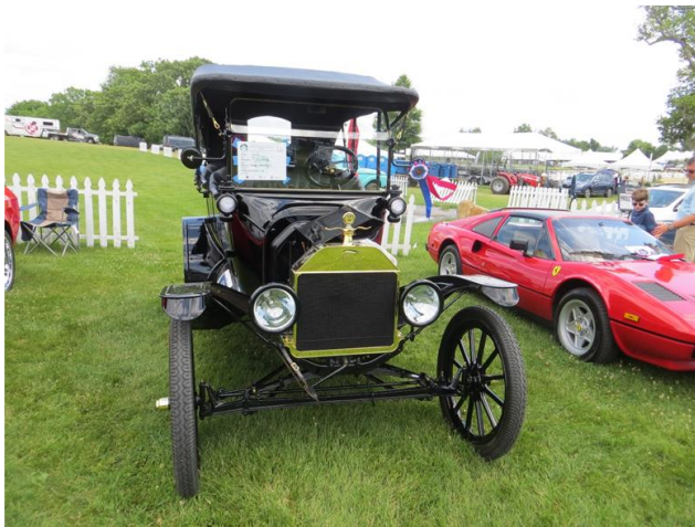
Randall's 1916 Ford Model T touring