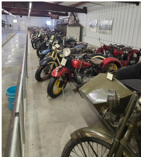
Display of antique motorcycles

He had a husband/wife team employed that scoured the country for items to show the progress of our country. Dream job if you ask me. We barely got through the autos-cars and tractors in the two hours before they closed. We only scratched the surface. We finished up our trip at the Shipwreck Museum in Paradise, MI where they have the bell from the Edmund Fitzgerald raised from 535 feet to the surface on display. Some of the documented shipwreck tragedies took only 16 minutes for a ship to disappear from radar after a "Mayday, Mayday" distress radio signal went out. I'd strongly recommend both museums if you are in Minden, Nebraska, or Paradise, Michigan. Plan 5 or 6 hours in Minden.