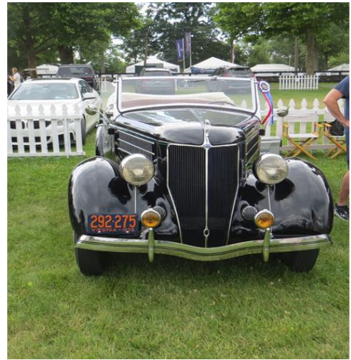
Zimmerli's 1936 Ford Phaeton