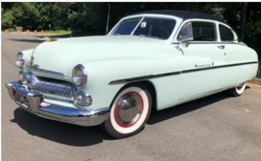
Leo Cummings' 1950 Mercury Monterey Tudor