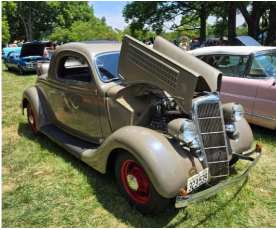
Hank Dubois' 3-window wonder