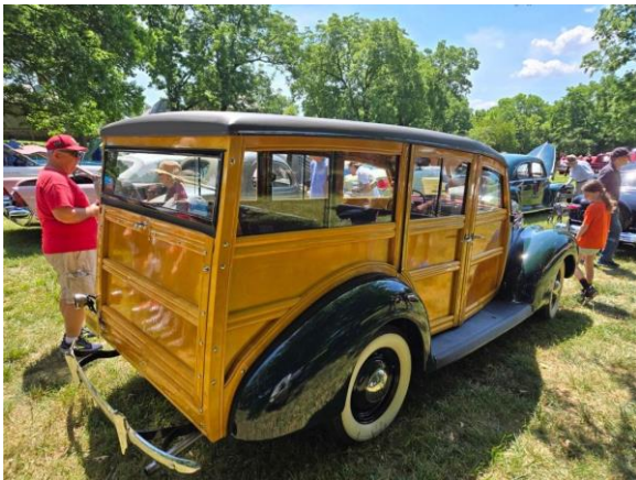
Dave Westrate Best of Show—Woodie Wagon