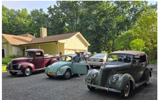
Arringtons in '41 pickup and '66 Beetle. Vignolas in '37 Phaeton