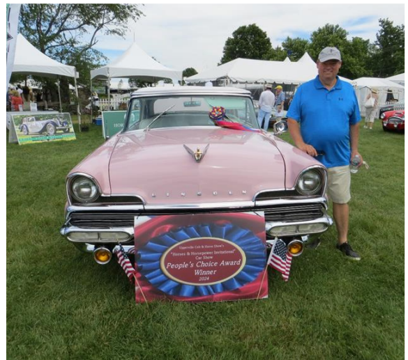
Rentsch's 1956 Lincoln convertible