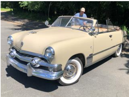
Milton Sprecher's 1951 Convertible