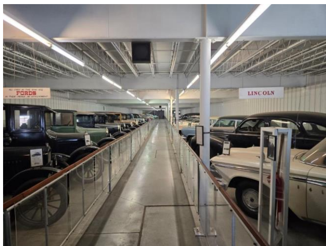
Pioneer Village 200 ft. row of cars