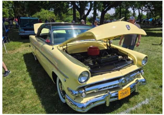
Leo Cummings Best of Class—'54 Ford