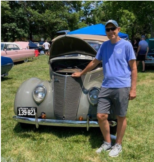
Bob Vignola's coming out party at Sully (just the car—not him)