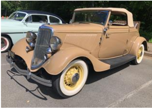
Dave Skiles' 1934 Cabriolet